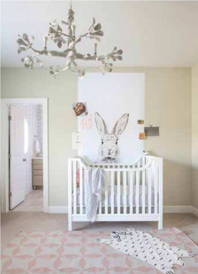
AUGUST / SEPTEMBER 2016 URBAN HOME TRIANGLE 37